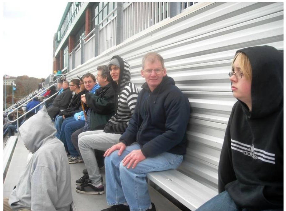
Knights and Squires attending the URI football game on Nov. 6.

“When they saw the star, they rejoiced with exceedingly great joy.” – Matthew 2:10