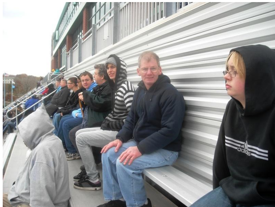
Knights and Squires attending the URI football game on Nov. 6.

"Do not withhold good from those who deserve it, when it is in your power to act. Do not say to your neighbor, 'Come back later; I'll give it tomorrow'- when you now have it with you." – Proverbs 3:27-28