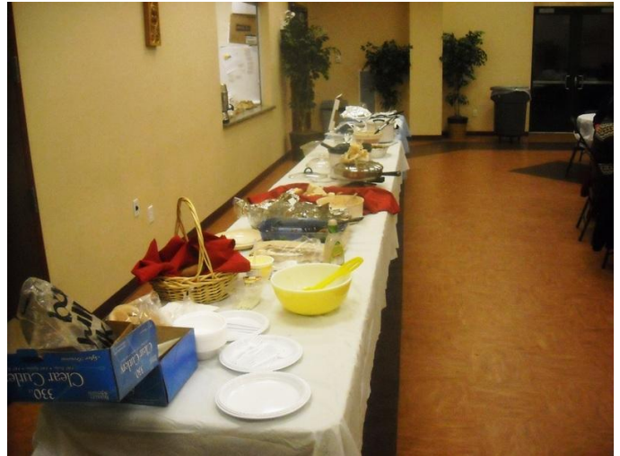
Plenty of great food!