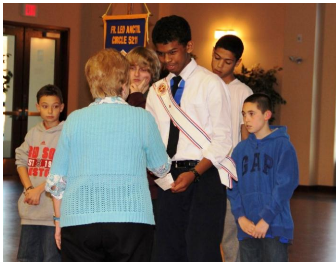
Squires Donation to SPRED West Warwick Program