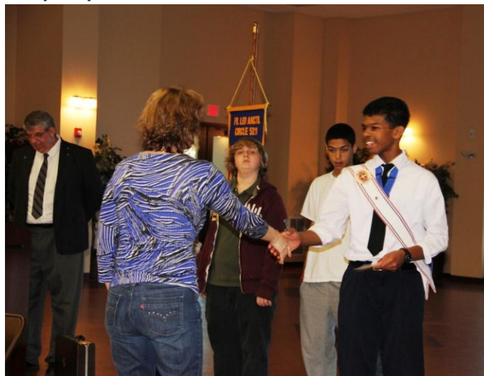
Squires Donation to Coventry High Life Skills Program