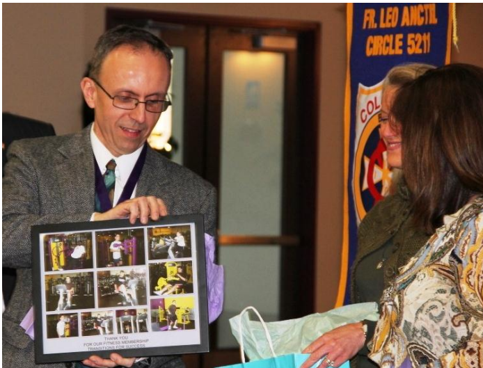
Blessing Council donation to Transitions for Success