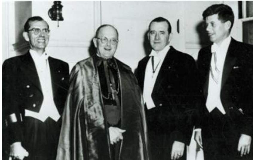
JFK (right) wearing the tuxedo and sash of a 4th Degree Knight of Columbus

From the sports world, baseball players Babe Ruth , Connie Mack , Joe DiMaggio , Gil Hodges and Ron Guidry were all Knights of Columbus. The Babe joined the Knights when he was still with the Red Sox. His home council is Pere Marquette K of C Council #271 in South Boston. We can also count two of the greatest NFL head coaches among our ranks – Vince Lombardi and Mike Ditka . Mr. Lombardi, a fourth-degree Knight, was a very devoted Catholic. I had occasion to visit Green Bay recently, and was honored by going to Mass at St. Willebrord Parish where he was a daily communicant. Former heavyweight boxing champions James J. Braddock and Floyd Patterson were Knights as well as professional wrestler “Captain” Lou Albano . Providence College fans will be pleased to know that Lenny Wilkens , a point-guard for the Friars from 1957-1960, and the 2 nd winningest NBA coach of all-time, is a Knight of Columbus.