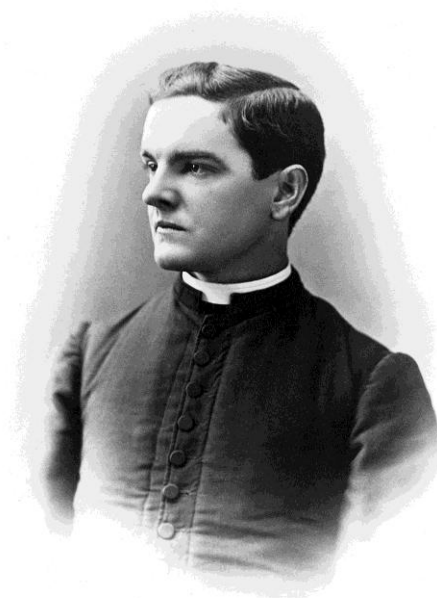
K of C Founder, Venerable Servant of God Fr. McGivney Babe Ruth around the time he joined the K of C.