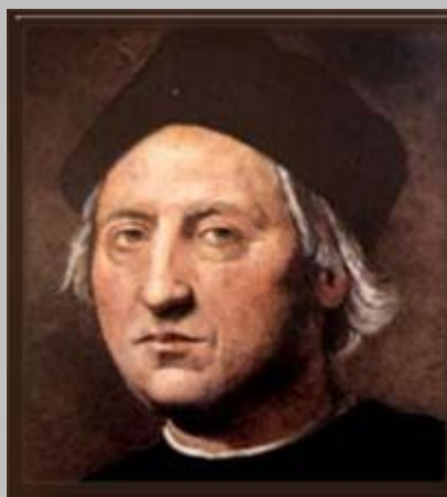
Portrait of Christopher Columbus