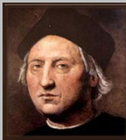
Portrait of Christopher Columbus