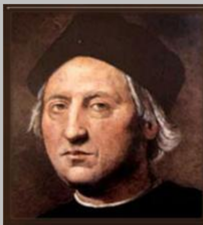
Portrait of Christopher Columbus