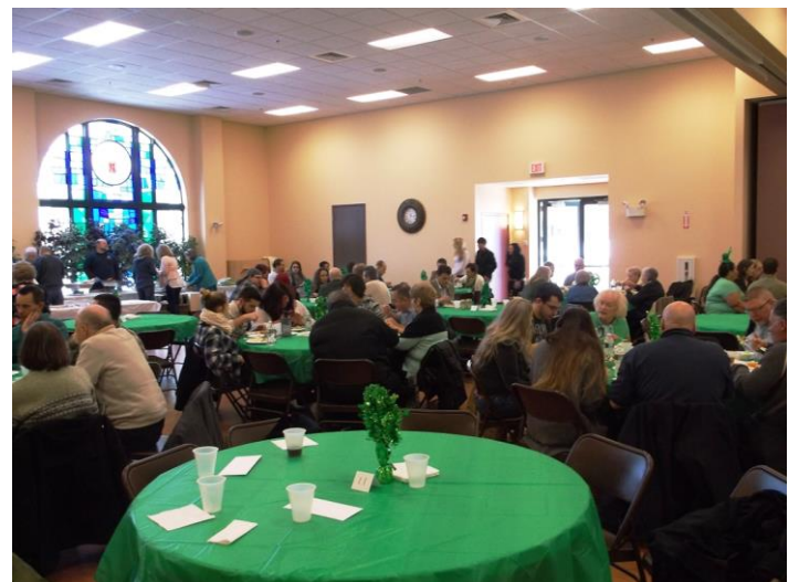
St. Patrick's Day Dinner Fundraiser – Sunday, March 15, 2015

"Jesus Christ is risen today, Alleluia! Our triumphant holy day, Alleluia!"