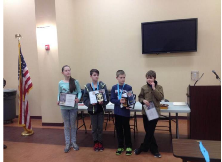
The four champions will be going on to the State Free Throw Championship to be held on Sunday, April 17 from 1PM to 4PM at Bishop Hendricken High School