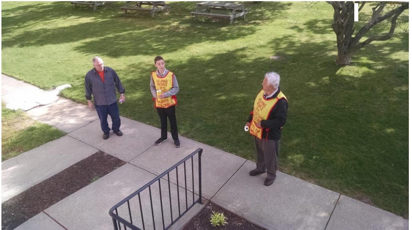
“KANDI Drive”, St. Vincent de Paul Church, May 15, 2016