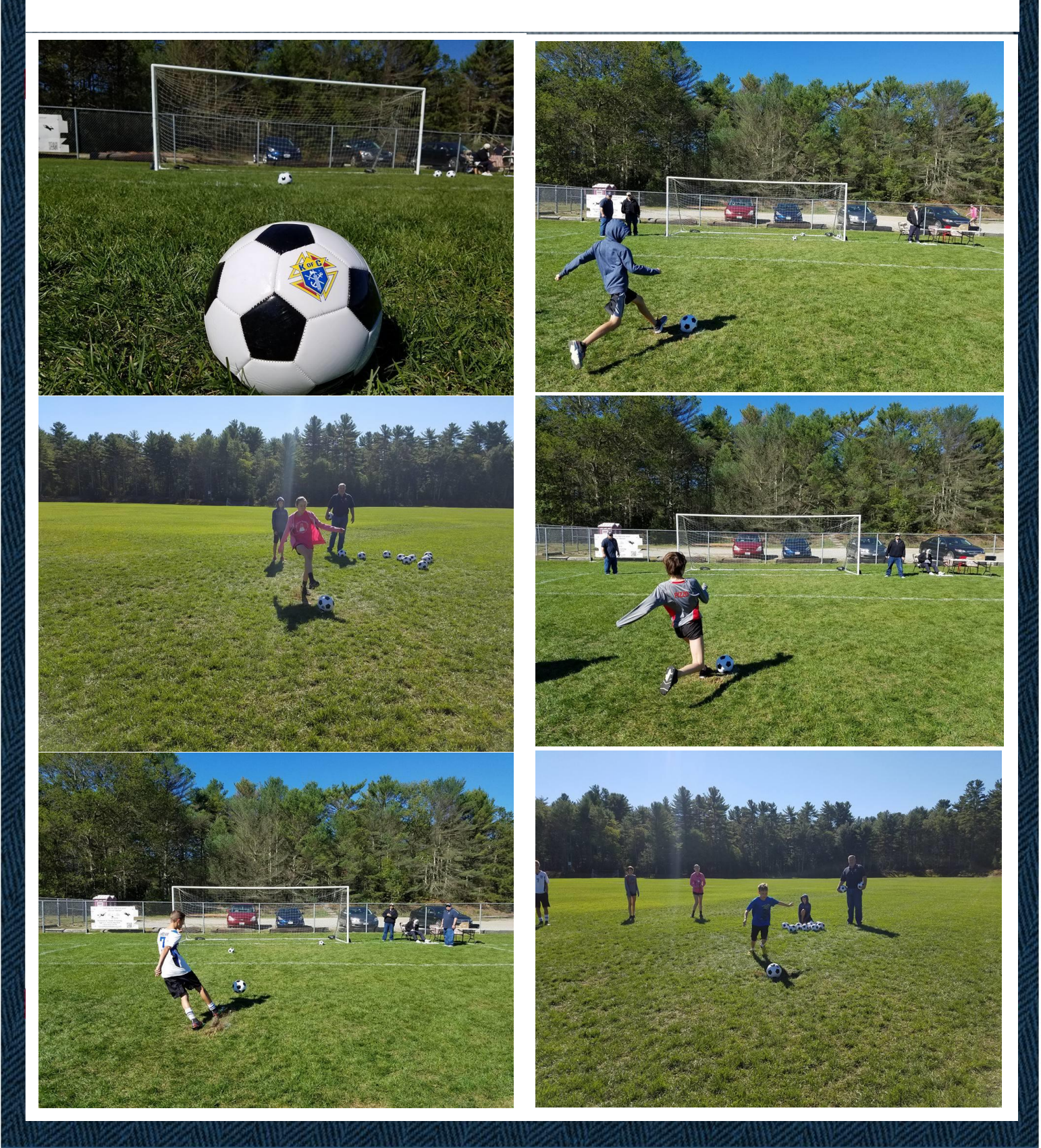
"But they that wait upon the LORD shall renew their strength; they shall mount up with wings as eagles; they shall run, and not be weary; and they shall walk, and not faint." – Isaiah 40:31