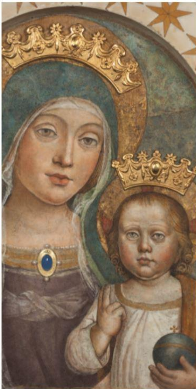
The ancient fresco of Madonna del Soccorso (Our Lady of Help) in St. Peter's Basilica was restored with the support of the Knights of Columbus to mark the Year of Faith (2012-2013).

O Mary, you always brighten our path as a sign of salvation and of hope. We entrust ourselves to you, Health of the Sick, who, at the Cross, took part in Jesus' pain while remaining steadfast in faith.