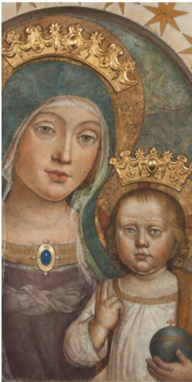
The ancient fresco of Madonna del Soccorso (Our Lady of Help) in St. Peter's Basilica was restored with the support of the Knights of Columbus to mark the Year of Faith (2012-2013).

O Mary, you always brighten our path as a sign of salvation and of hope. We entrust ourselves to you, Health of the Sick, who, at the Cross, took part in Jesus' pain while remaining steadfast in faith.