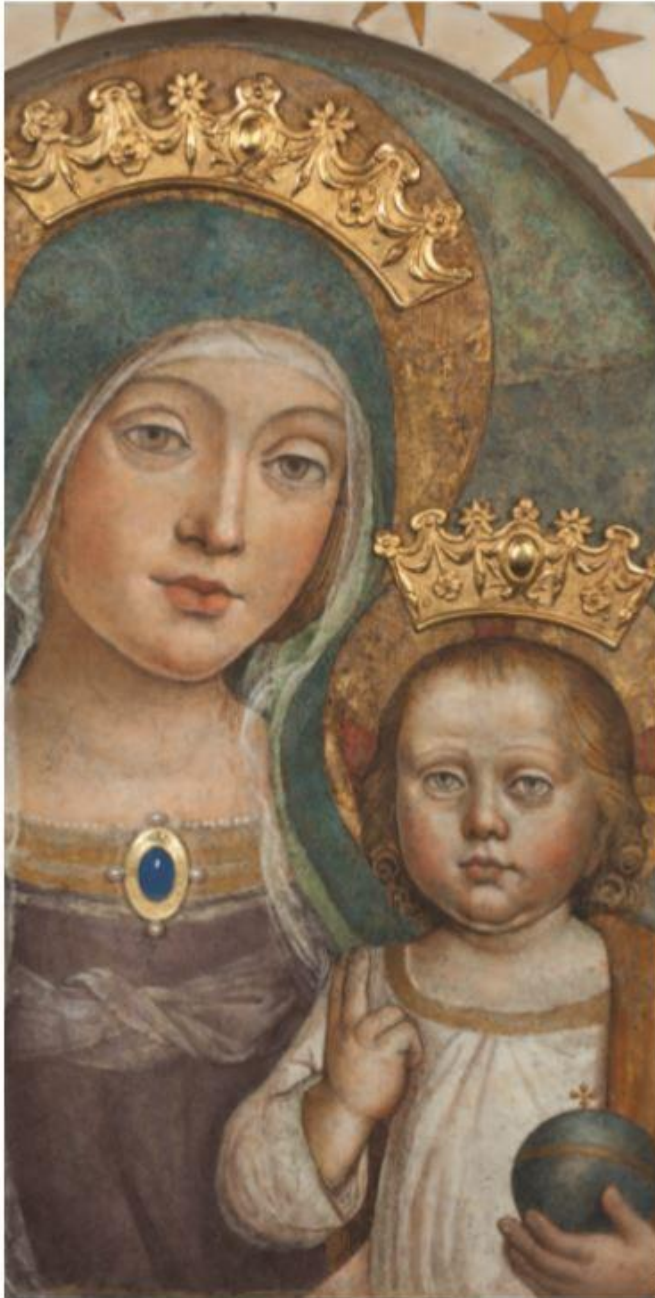
The ancient fresco of Madonna del Soccorso (Our Lady of Help) in St. Peter's Basilica was restored with the support of the Knights of Columbus to mark the Year of Faith (2012-2013).

O Mary, you always brighten our path as a sign of salvation and of hope. We entrust ourselves to you, Health of the Sick, who, at the Cross, took part in Jesus' pain while remaining steadfast in faith.