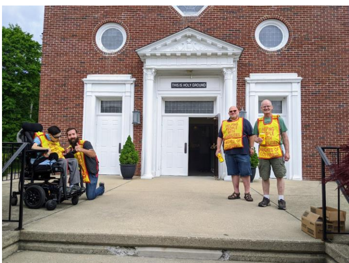
"Christ set us free, so that we should remain free. Stand firm, then, and do not let yourselves be fastened again to the yoke of slavery." – Galatians 5:1