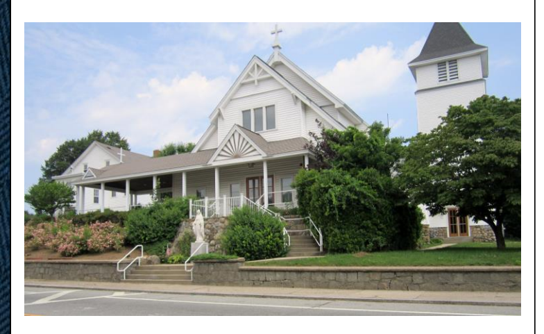
CHANGE OF VENUE

Starting this month, the venue for Blessing Council Officers and Membership Meetings will now be the Our Lady of Czenstochowa Meeting Room. This is the building to the far left in the photo above and looking from Washington St. (117). The address for our new venue is 445 Washington Street in Coventry.